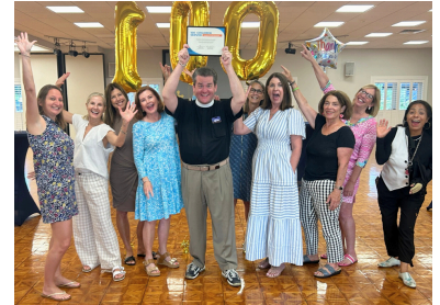
Redeemer has met 112 CarePortal requests, helping 189 children with an economic impact of over $47,000.