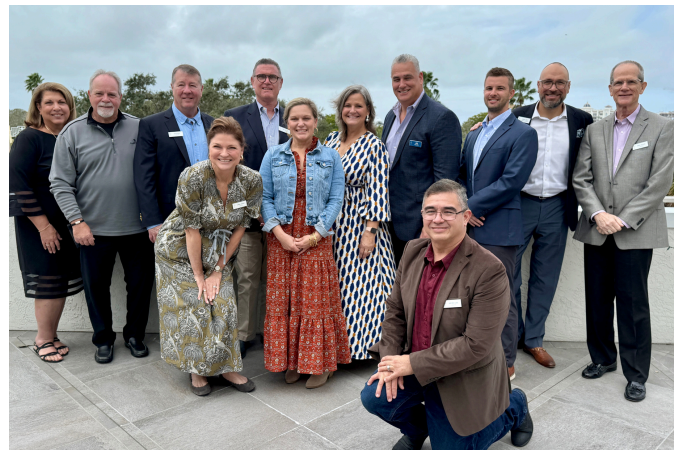
Redeemer's 2024 vestry members gathered on the Goewey Hall terrace after a meeting.