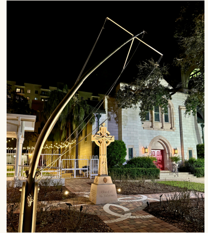
Hurricane Milton bent the steel flagpole in front of Redeemer toward the church.

Hurricane Helene made landfall in Florida's Big Bend area on September 26. Its storm surge caused extensive damage to Sarasota's barrier islands, and water nearly reached the church. Two weeks later, Hurricane Milton made landfall on Siesta Key, leading to damage throughout Sarasota. Redeemer faced many downed branches, but as with Helene, the church and offices sustained no water intrusion. Thank you to staff and parishioners who helped the parish prepare and recover from the storms.